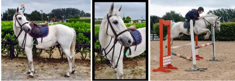
Lot No 56, CLASSIEBAWN WHITE KNIGHT, Grey Gelding, 150 cm, b 2006 (S3-02405)

Sire: Jacks Promise, Dam: Drumadavey Damsel, Sire of Dam: Monaghanstown Fred