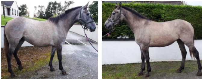
Lot No 57, COURTWOOD EMER, Grey Mare, 15.3 hh, b 2013 (5583205)

Sire: Watermill Swatch, Dam: Courtwood Ceili, Sire of Dam: Cork Arthur